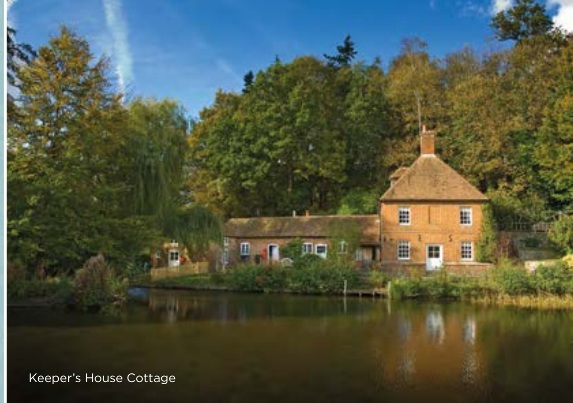
Keeper's House Cottage

Our Lakeside Lodges offer a truly unique and unforgettable experience, with breathtaking views overlooking the Great Water. Designed with meticulous attention to detail, they offer a perfect blend of contemporary design and timeless charm, harmonising with the picturesque surroundings.