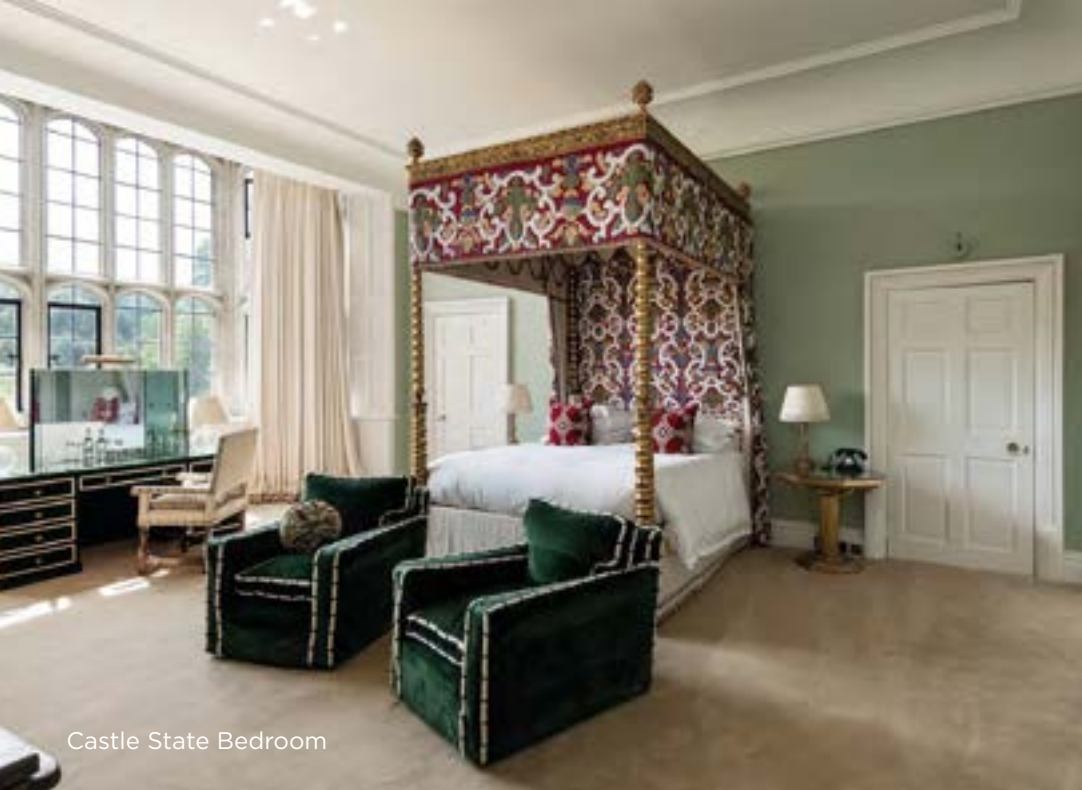
Castle State Bedroom